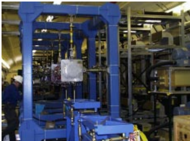
Fig. 3. LEDA RFQ installed in the beam tunnel.

Of the eight separate sections, three are used for 350-MHz RF power feed [19] via four 250-kW coupling irises (12 total) and three sections provide vacuum pumping. Each section includes 16 static slug tuners, used only for tailoring the initial field distribution. Fabrication of the LEDA RFQ [20], the vacuum system [21, 22] and the resonance-control cooling system [23] is complete; this equipment is installed in the LEDA beam tunnel (Fig. 3); and the RFQ RF-field tuning procedure is complete [24].