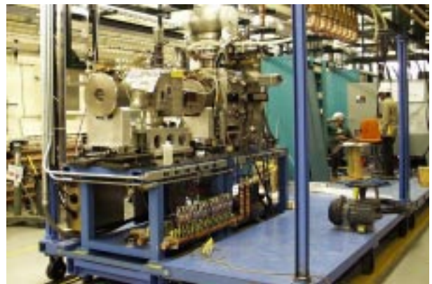
Fig. 2. LEDA injector installed in the beam tunnel.

The low-energy beam transport (LEBT) uses two solenoids and two steering coils to ensure a proper match into the RFQ. A well-cooled variable-iris device is used to control injected current [5], and a microwave power modulator is used to provide beam pulsing [6] for commissioning and beam-tuning activities. Multiple extended beam runs with this injector have shown it capable of the required current, emittance, and stability. Measured erosion rates show a predicted maintenance-free lifetime exceeding 400 hours. The LEBT physics design [7, 8] is in good agreement with the mechanical design [9] and detailed measurements [10]. The LEDA injector is now installed in the beam tunnel (Fig. 2).