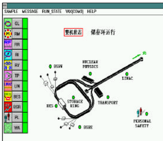
Fig. 3 Initial View on First Screen

one child window is pop-up by clicking the mouse on the right button and will show the message of assigned subsystem. Each indicator displays one subsystem's status. The green, red and yellow colors of the indicator indicate fatal failure, secondary failure and normal respectively.