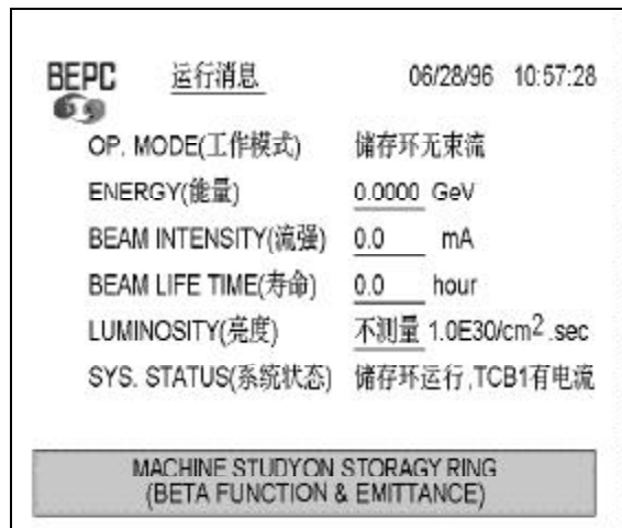
Fig.4 BEPC Operation Message on Second Screen

the error message should be displayed on screen 1.